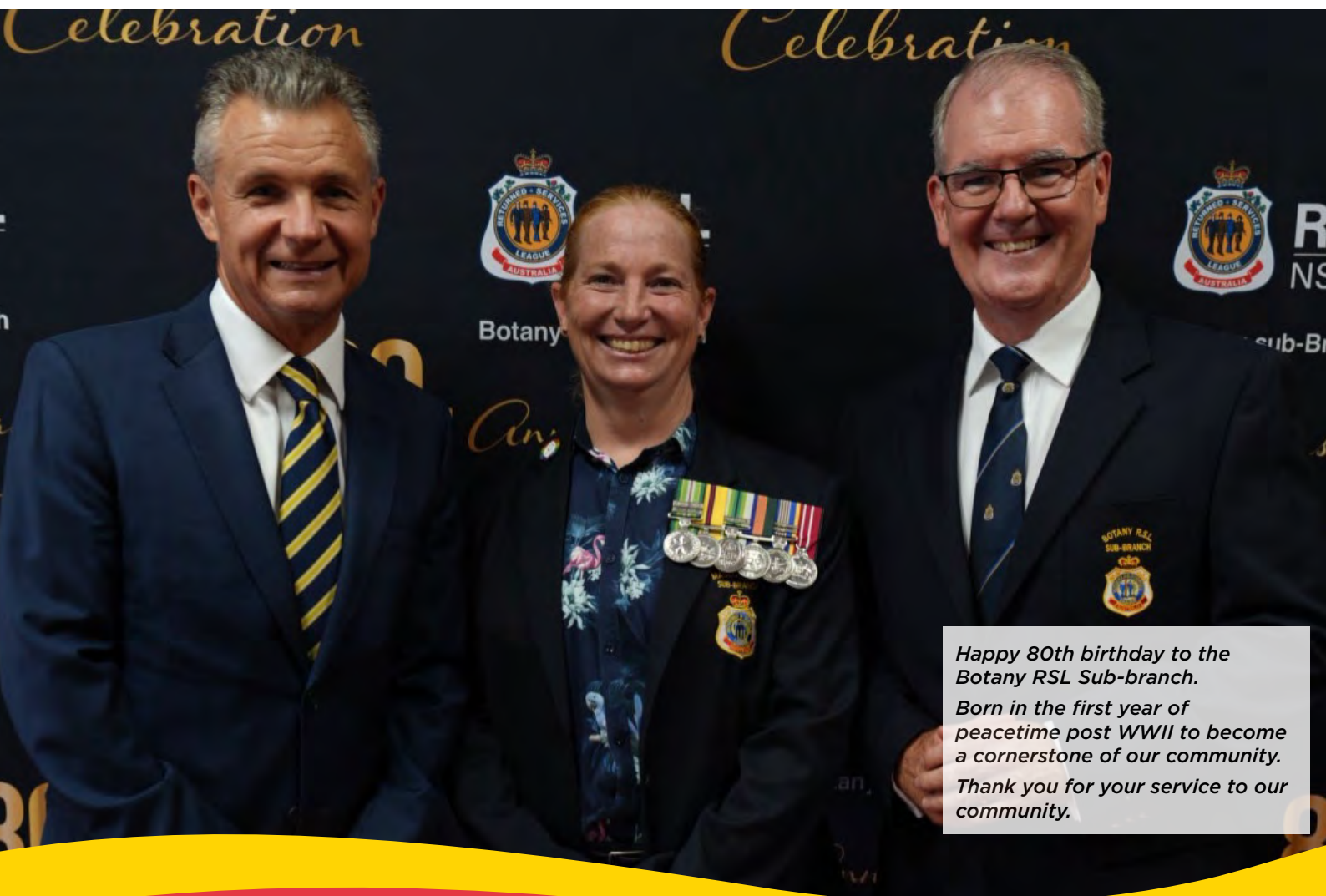
Happy 80th birthday to the Botany RSL Sub-branch. Born in the first year of peacetime post WWII to become a cornerstone of our community. Thank you for your service to our community.

① https://www.grants.gov.au/Go/Show?GoUuid=01041482-3596-4da5-bf1e-e0b605892762