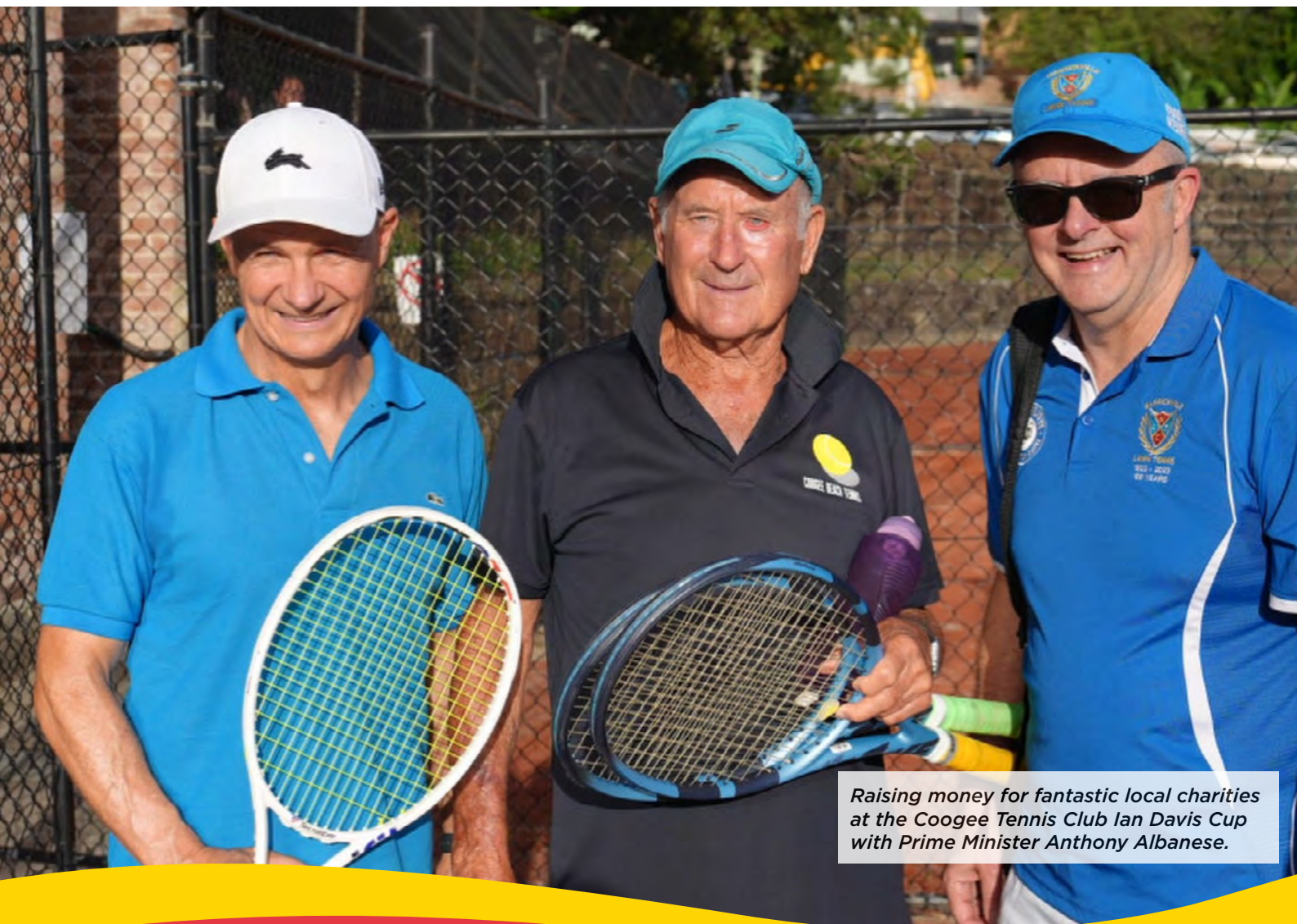
Raising money for fantastic local charities at the Coogee Tennis Club Ian Davis Cup with Prime Minister Anthony Albanese.

① https://brainfoundation.org.au/apply-for-research-funding/