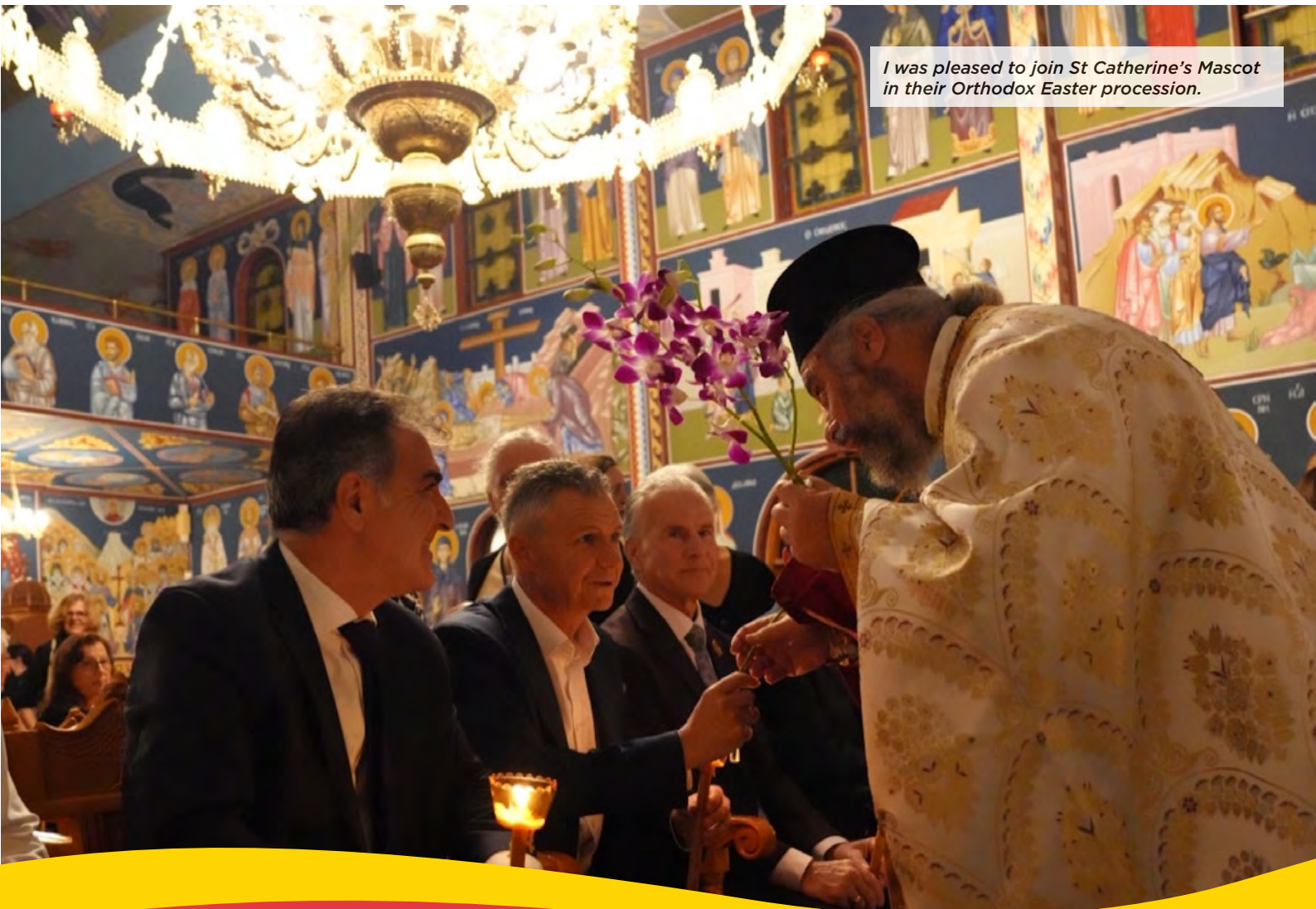
I was pleased to join St Catherine's Mascot in their Orthodox Easter procession.

① https://www.dfat.gov.au/people-to-people/direct-aid-program/direct-aid-program