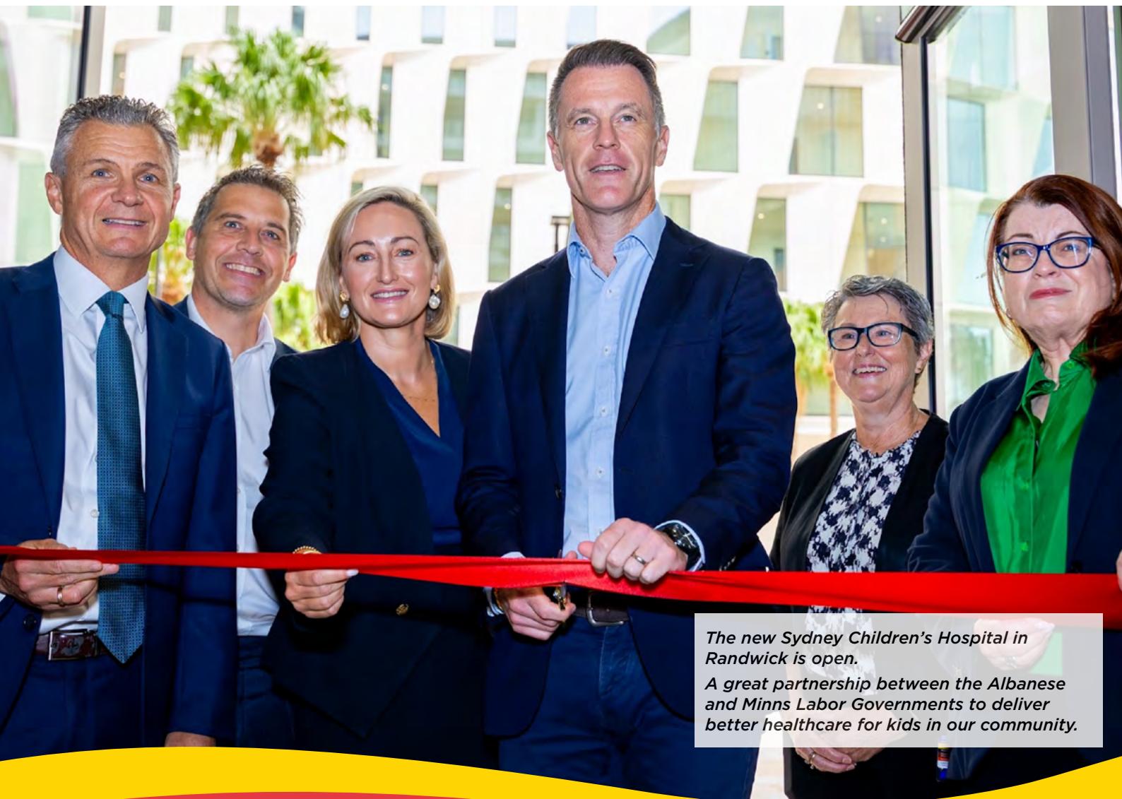
The new Sydney Children's Hospital in Randwick is open. A great partnership between the Albanese and Minns Labor Governments to deliver better healthcare for kids in our community.