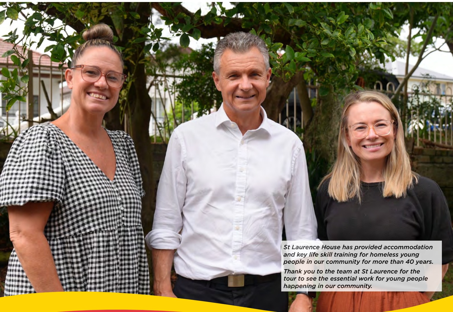
St Laurence House has provided accommodation and key life skill training for homeless young people in our community for more than 40 years. Thank you to the team at St Laurence for the tour to see the essential work for young people happening in our community.