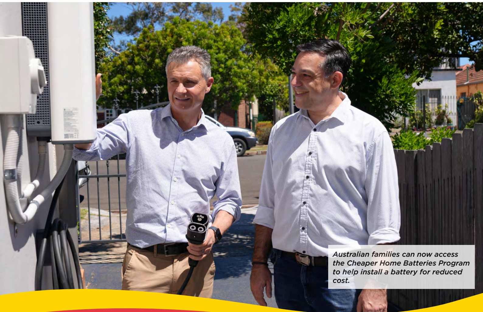
Australian families can now access the Cheaper Home Batteries Program to help install a battery for reduced cost.

① https://www.sydneywater.com.au/about-us/our-organisation/who-we-sponsor/community-grants.html