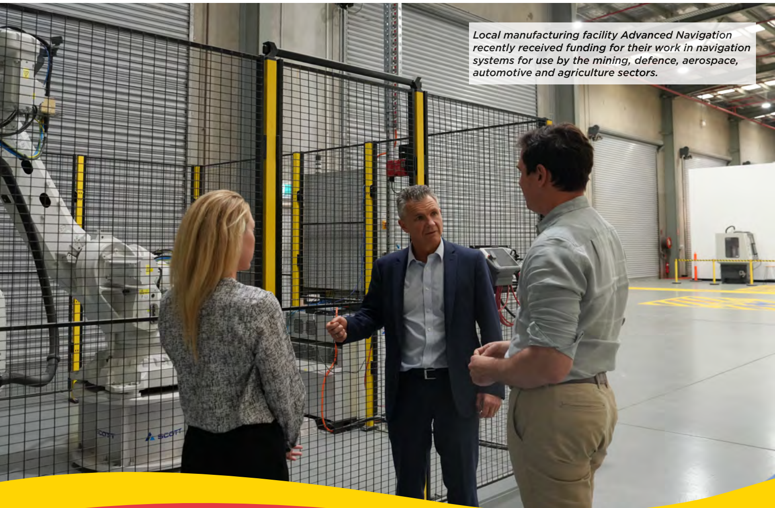
Local manufacturing facility Advanced Navigation recently received funding for their work in navigation systems for use by the mining, defence, aerospace, automotive and agriculture sectors.