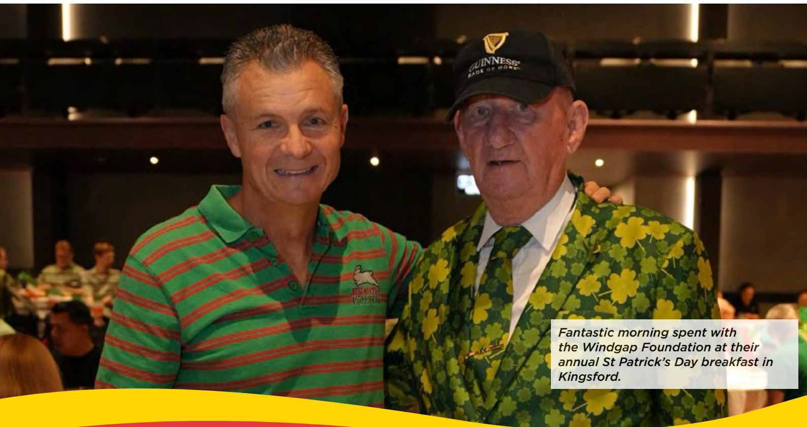
Fantastic morning spent with the Windgap Foundation at their annual St Patrick's Day breakfast in Kingsford.