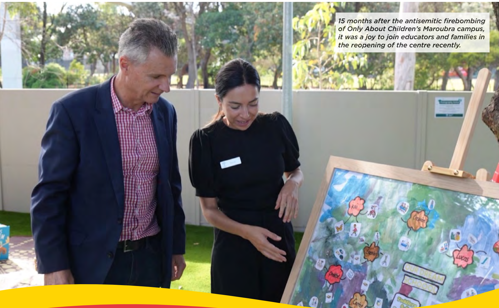
15 months after the antisemitic firebombing of Only About Children's Maroubra campus, it was a joy to join educators and families in the reopening of the centre recently.

① https://www.fulbright.org.au/scholarships/?loc=au